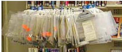
books on tape